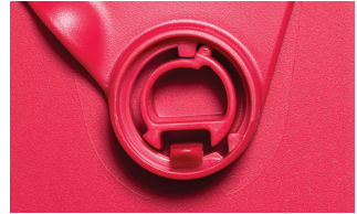
Dustpan lid in unlocked position

To Unlock: Lean the handle forward until you hear a "pop." The dustpan will then swivel to close.