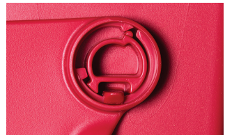
Dustpan lid in locked position