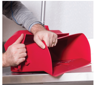
Note: Grooves are present on both sides of the lid to assist lid removal

To Reassemble: Line up the lid hole with the dustpan hinge and press firmly until the lid pops in place. Repeat for opposite side.