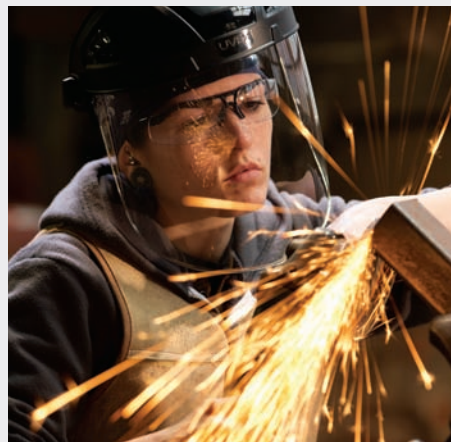
Photos taken at The Steel Yard - 27 Sims Ave, Providence, RI 02909