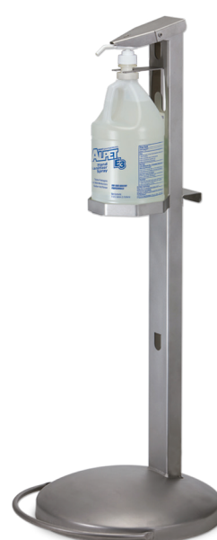
EZ-Step Portable Foot-Activated Dispenser Sanitizer sold separately