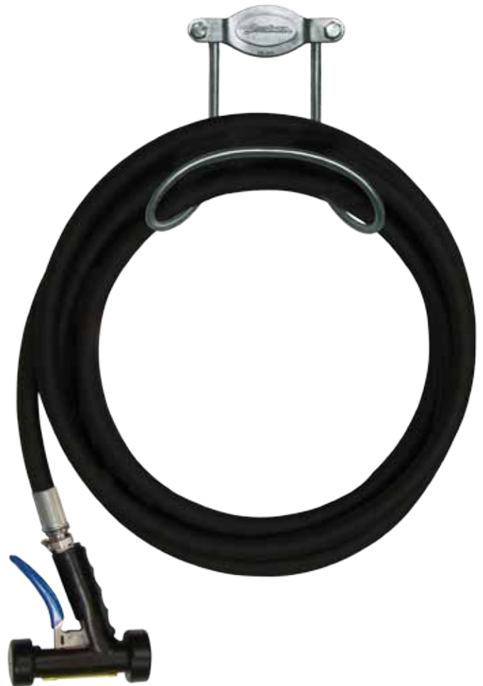
Shown: HR-100 Wall-Mounted Hose Rack; shown with premium hose assembly and S-70 Series nozzle.

Using \frac{5}{8} " Masonry Drill, drill two holes on a horizontal line made deep enough to admit the Loxin Shields. Insert Shields with nut end to back of hole and tighten screw until rack is securely fastened to wall.