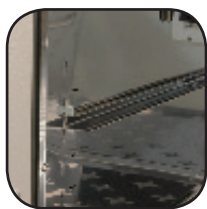
Adjustable, No Tip Shelf Design

The general purpose series models include a sealed, inner glass door which provides a view into the chamber without compromising samples or the chamber environment. The optional factory installed reversible door makes it easier to fit these incubators into your laboratory. Stainless steel panels and doors reduce contamination, provide durability and allow for easy cleaning.