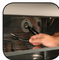
Throughwall Access Port