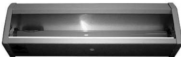
GUARDIAN® MODEL GB18

Guardian® Wall Mount Glueboard Fly Traps are ideal for areas where other insect control devices are inadequate or not allowed due to the proximity of open foods and food preparation areas.