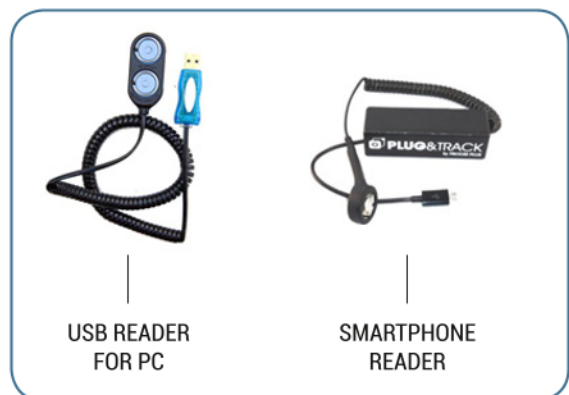
USB READER FOR PC