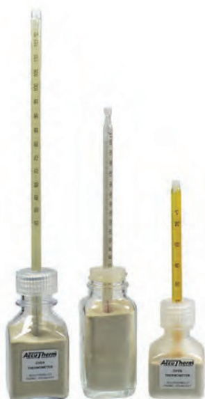
60ml 100ml 30ml Oven Thermometers