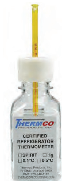
250ml Blood Bank Refrigerator