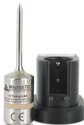
IFC400 (sold separately)

The HiTemp140 can store up to 32,700 readings, and features a rigid external probe capable of measuring extended temperatures, up to 260 °C (500 °F). Custom probe lengths are available up to 7 inches. The device records date and time stamped readings, and has non-volatile solid state memory.