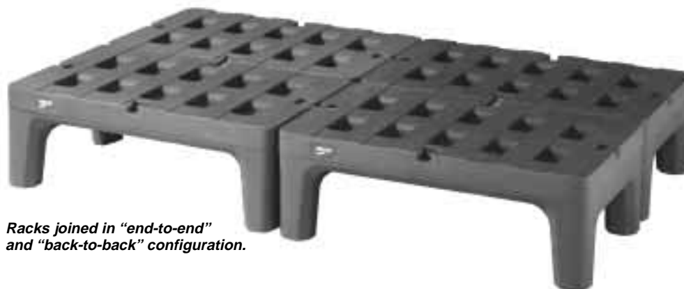
Racks joined in "end-to-end" and "back-to-back" configuration.