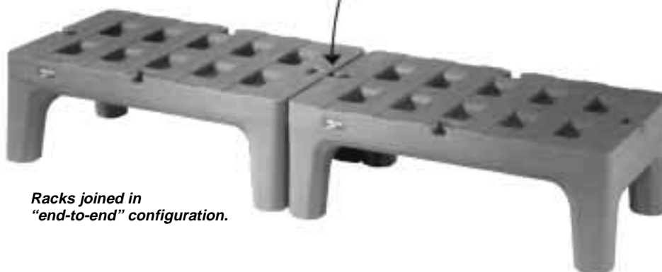
Racks joined in “end-to-end” configuration.

*MICROBAN® and the MICROBAN® symbol are registered trademarks of the Microban Products Company, Huntersville, NC.