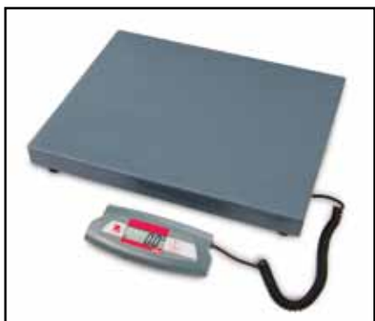
165lb and 440lb models available with large platform