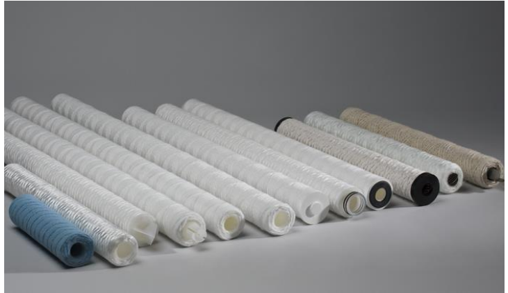
DW Series string wound filter cartridges are available in a variety of sizes and configurations.

The DW series string wound filters protect processes, people and the environment around the world. These depth filters offer a choice of filtration media, support cores, and materials to enable compatibility with most applications. End fitting options allow the retrofitting of most filter housings. Delta Pure Filtration is able to satisfy large orders with fast lead times. For potable water to aggressive chemicals, the DW series cartridges provide progressive depth filtration with high sediment-holding-capacity. Precision winding geometry provides consistent and controlled removal-efficiency.