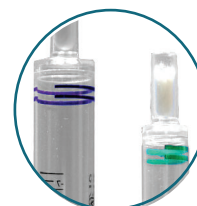
Color coded rings for easy identification

Dispenser box allows user to remove pipettes without opening top. Universal stacking design requires less laboratory space and each box is color coded for easy recognition.