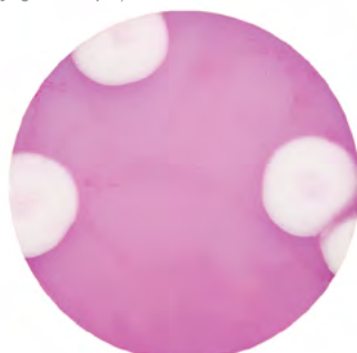
DBRC agar spread plate at 5 days incubation