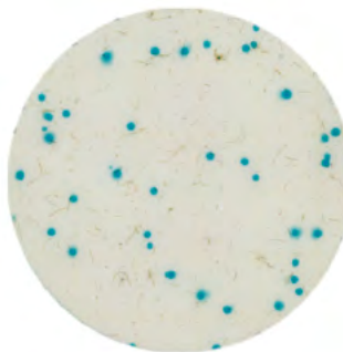
3M™ Petrifilm™ Rapid Yeast and Mold Count Plate at 48 hours incubation

( Candida tropicalis in smoked salmon sample)