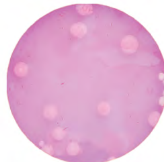
DBRC agar spread plate at 5 days incubation