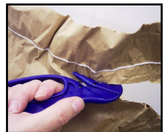
Bags & Sacks

Please test detectable products with YOUR detection equipment prior to use