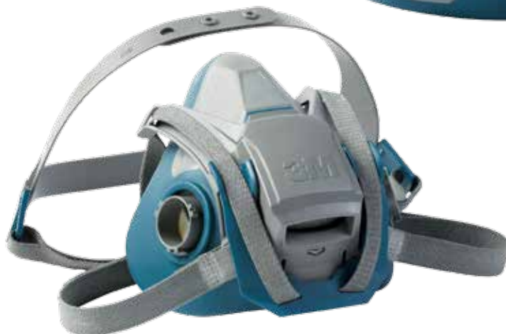
6500QL (Quick Latch) Series