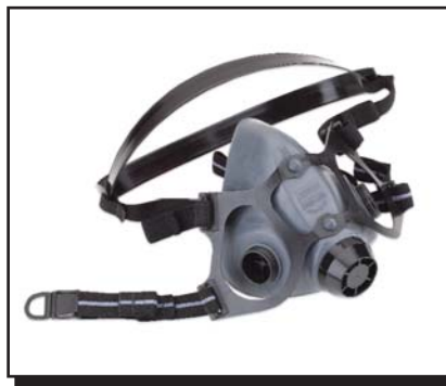
North 5500 Series Half Mask "The economical alternative"