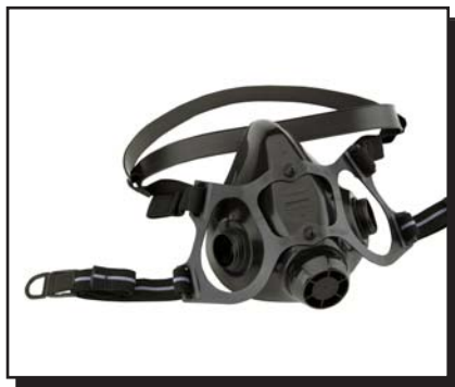
North 7700 Series Half Mask "The industry standard"