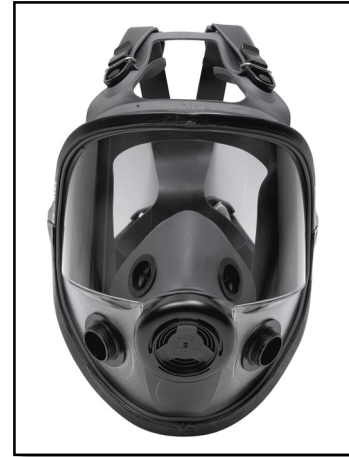
North 5400 Series Full Facepiece "The best value facepiece"