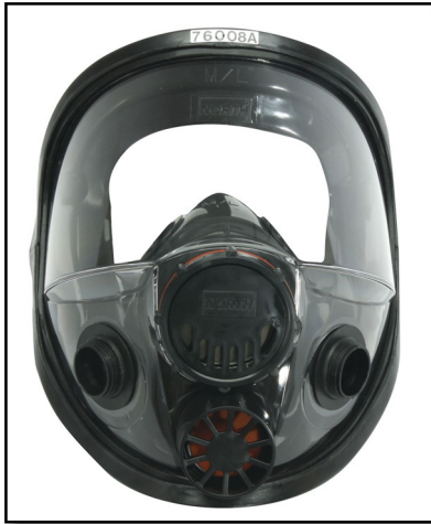
North 7600 Series Full Facepiece "The most comfortable medical grade silicone facepiece"