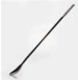
SP BEL-ART TEFLON FEP LAB SPOON AND SPATULA; 9 IN., STAINLESS STEEL

This stainless steel sampling spoon has an anti-stick, corrosion-resistant surface.