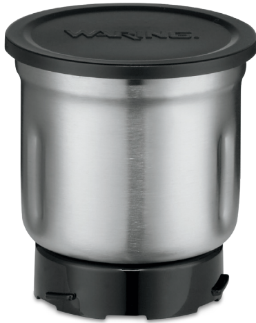
CAC103 Stainless Steel Bowl with Lid