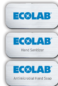
Product Category Badges