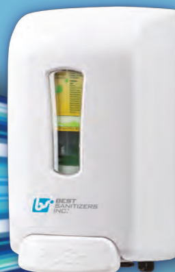
VersaClenz Manual MD10030 (White) MD10030B (Black)