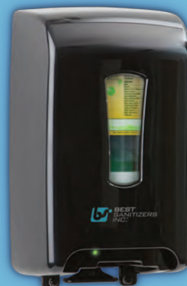
VersaClenz Touchless AD10048B (Black) AD10048 (White)

Durable construction suitable for high traffic areas. Case is splash-resistant and easy to clean.