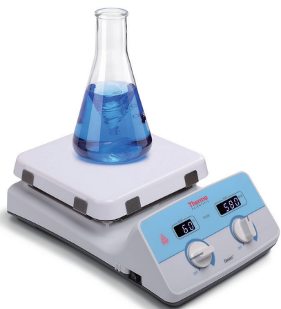
Cimarec + Stirring Hotplate

Please read all the information in this manual before operating the unit.