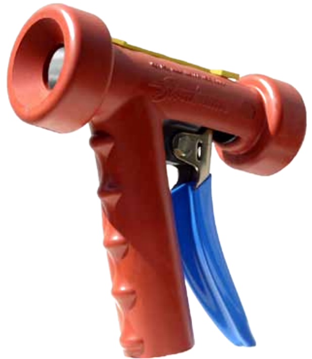
Shown: Red S-Series Nozzle Available shown below: S-70 (black cover), S-75 (white cover)

Please see reverse side for parts listing.