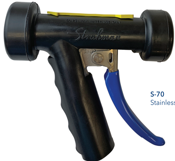
S-70 Stainless Steel