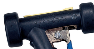
RUBBER COVER - BLACK