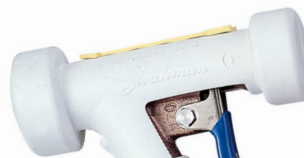
RUBBER COVER - WHITE