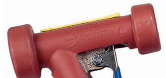
RUBBER COVER - RED