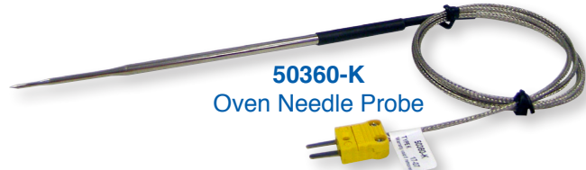
50360-K Oven Needle Probe