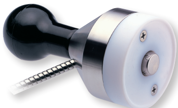
50014-K Weighted Griddle Surface Probe