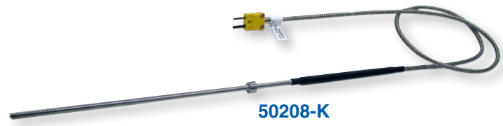
50208-K Fry Vat Probe