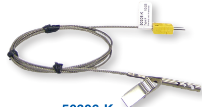
50306-K Oven / Freezer Probe