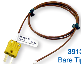
39138-K Bare Tip Probe