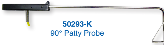
50293-K 90° Patty Probe