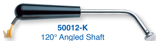
50012-K 120° Angled Shaft Surface Bell Probe