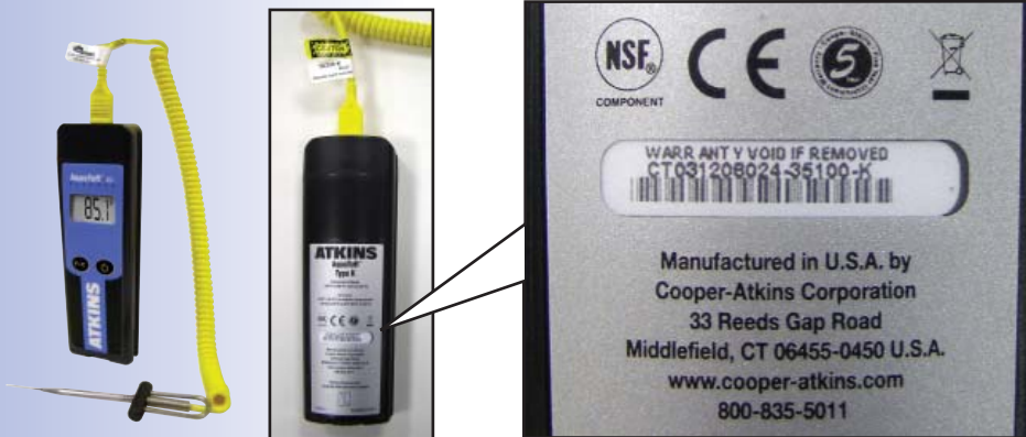
AquaTuff™ 35100-K Thermocouple Instrument

If your Thermocouple Instrument has a 9-digit code, followed by the model number, the first two digits represent the month of manufacture, the second two digits represent the day of manufacture, and the third two digits are the year of manufacture (For example: s/n CT031208024-35100-K was manufactured on March 12, 2008).