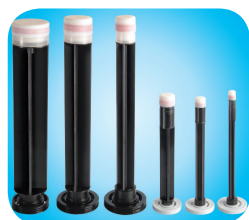
Piston: Specially designed PTFE piston ensures smooth, effortless movement and high accuracy.