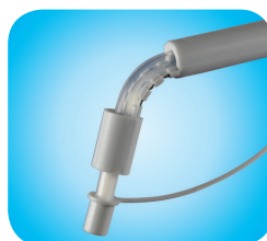
Adjustable Nozzle with Cap: Delivery nozzle adjusts for easy dispensing at different angles. Cap prevents any unwanted drops on the workspace and avoids contact with chemicals.