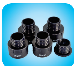
Adapters: A set of adapters to fit most laboratory reagent bottles are provided. Sizes are 28, 30, 32, 36, 40, and 45 mm.