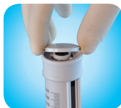
Calibration: Specially designed calibration tool is provided for convenient and quick in-lab user re-calibration. This is in compliance with GLO/ISO norms.