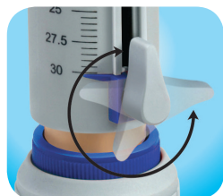
Volume Adjustment Knob: Quick-set volume adjustment knob with large pointer enables precise, easy, and fast volume adjustment.