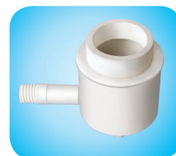
Valve Manifold: Specially designed, springless, PTFE valve manifold provides excellent chemical compatibility and leak-proof valve functioning.