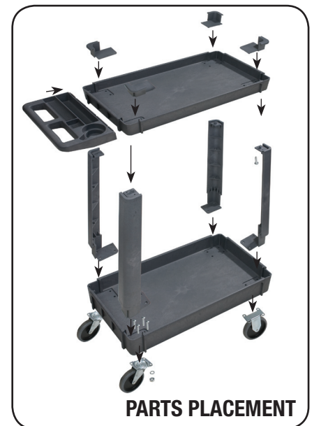
ASSEMBLED SERVICE CART