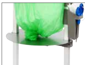
Adjustable plate for Stand Classic Mini Item no. 31480 Reduces the consumption of bag material and reduces the size of the bag. Primarily intended for use with sticky, heavy waste. Can be used for Bio bag cassettes.