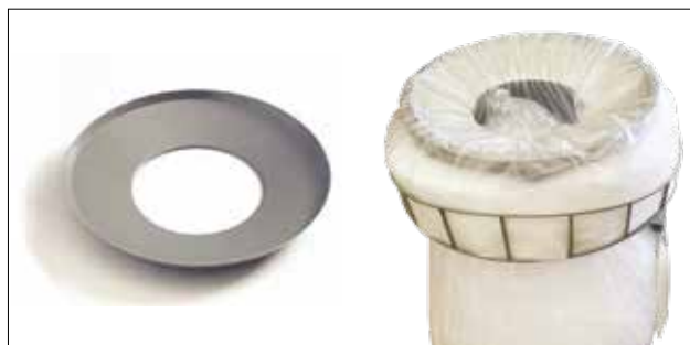
Adapter disc for Longopac Stand Classic Maxi Item no. 30170 Reduces the aperture for easier compression of e.g. recycled plastic. Only available for Maxi.