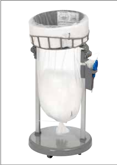
Stand Classic Mini/Mini Food