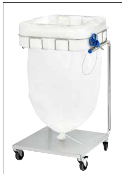
Stand Dynamic Maxi/Maxi Pedal