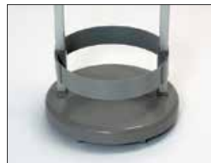
Frame for Longopac Stand Classic Mini Item no. 33890 The frame holds the bag in place.