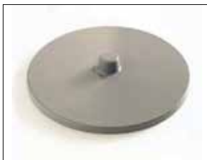
Lid for Longopac Stand Classic Maxi and Mini Mini Item no. 31140 Maxi. Item no. 30140