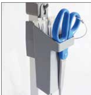
Cable-tie holder for Longopac Stand Classic Standard, grey. Item no. 30410 Metal-detectable, blue. Product no. 30416 The cable-tie holder speeds up bag changes even more and holds the cable ties in place. Suitable for both Maxi and Mini, and available in two versions.