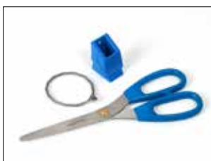
Scissors kit for Longopac Stand Dynamic, metal-detectable Item no. 34609 Kit containing metal-detectable scissors, scissors holder, stainless steel wire.