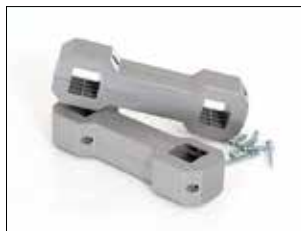
Connector for Longopac Stand Classic Item no. 33750 Connects two or more Longopac Stand products simply and securely. It is also possible to connect Maxi to Mini.