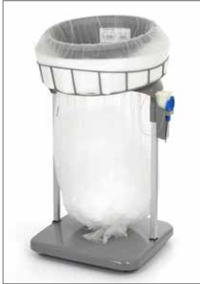
Stand Classic Maxi/Maxi Food