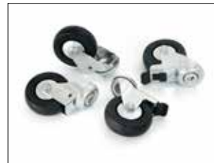
Stand Dynamic ESD Kit Wheels Item no. 34616 Contains four castor wheels, two of them with brakes. Replaces the original wheels on stands used in ESD restricted areas.