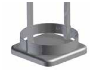
Frame for Longopac Stand Classic Maxi Item no. 33900 The frame holds the bag in place.