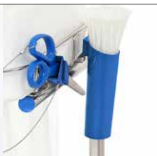
Cable-tie holder for Longopac Stand Dynamic Item no. 30410 (only holder) The cable-tie holder for the Dynamic range is suitable for Mini, Midi and Maxi Dynamic.