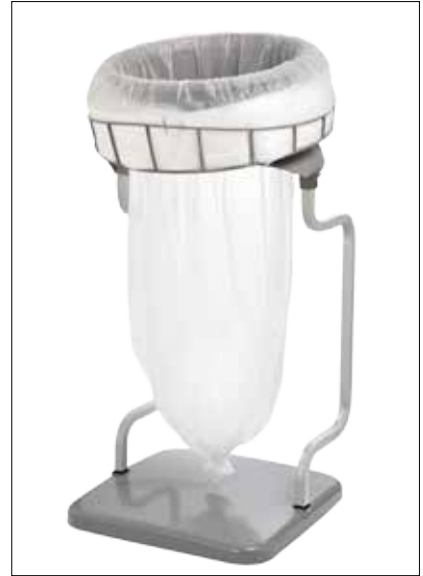
Stand Classic Recycling