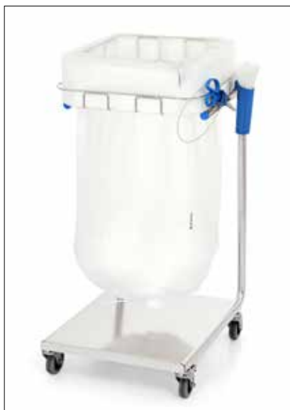
Stand Dynamic Midi/Midi Pedal