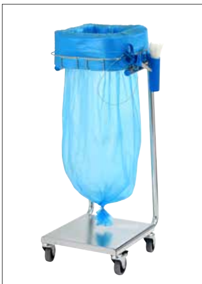
Stand Dynamic Mini/Mini Pedal