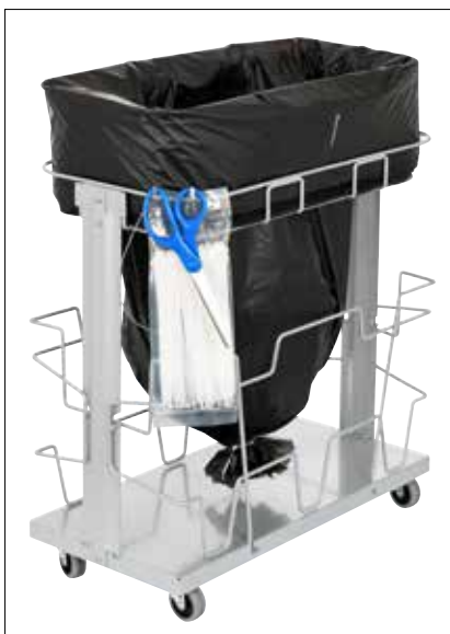
Stand Dynamic UBS