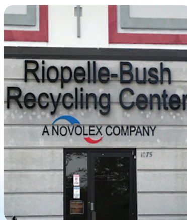
Novolex recycling center Shawano, WI

Novolex runs North America's only closed-loop recycling program for plastic bags. We partner with retailers across the country to collect plastic bags and bring them to this state-of-the-art recycling plant.