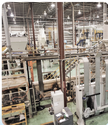
Novolex recycling center in North Vernon, IN

Novolex runs North America's only closed-loop recycling program for plastic bags. We partner with retailers across the country to collect plastic bags and bring them to this state-of-the-art recycling plant.