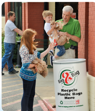
Novolex recycling bins across the country

Our efforts in sustainability and the circular economy go far beyond one product. We have a portfolio of solutions focused on source reduction, energy and water conservation, and end-of-life product planning and management. Our sustainability solutions include: plastic and paper products made from recycled content, compostable products, renewable substrates, the Novolex Bag-2-Bag recycling program, lower impact substrates, and other industry innovations that minimize raw materials usage while maximizing performance.