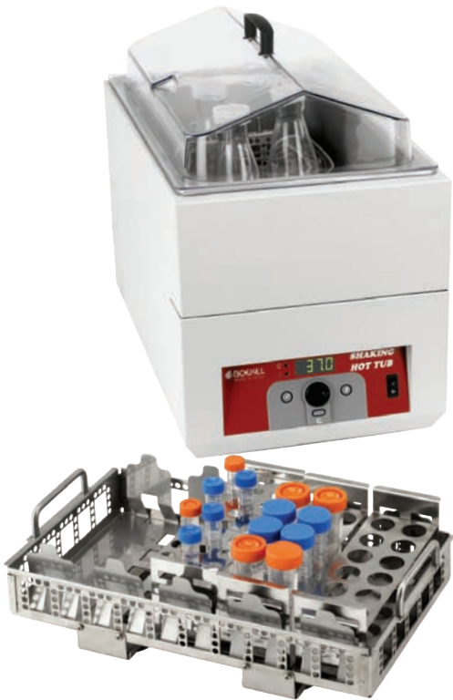
All trays sold separately. See Accessories on the back page.