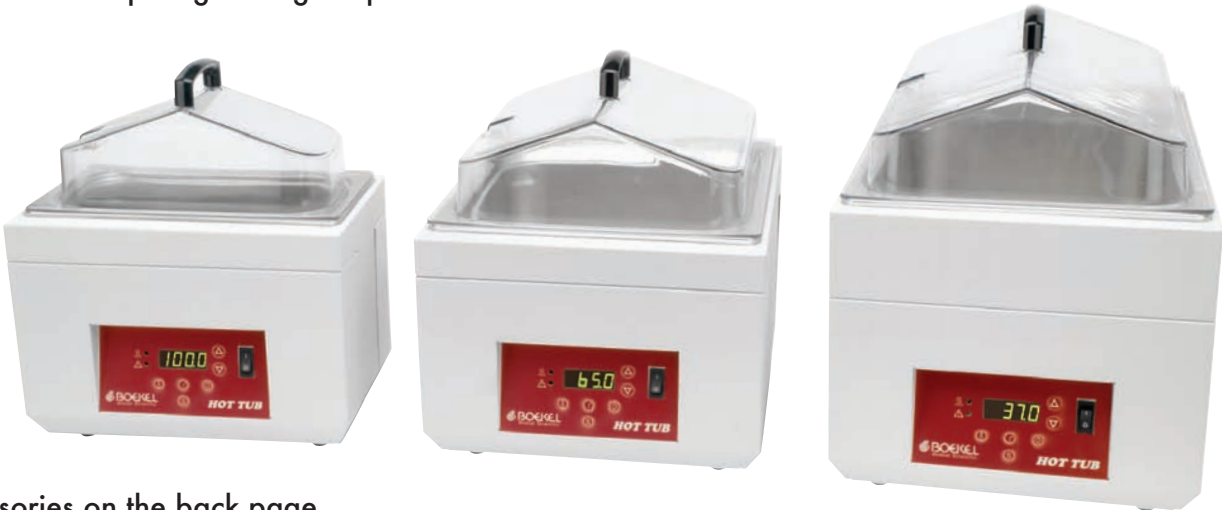
See Accessories on the back page.