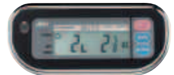
Lb/fractional oz mode, SK-WPZ models