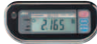
Lb mode, SK-WP models