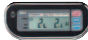
Lb/decimal oz mode, SK-WPZ models