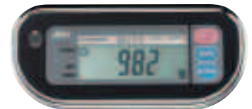
Metric mode, SK-WP models