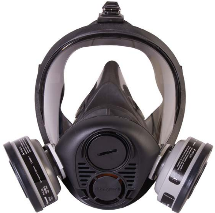
North RU6500, shown with North N-Series Organic Vapor cartridges. Filters and cartridges sold separately.

The RU6500 Series with 4-point headnet easily accommodates other personal protective apparel such as a hardhat or earmuffs.