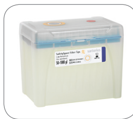
Single Tray racks purity-certified tip racks