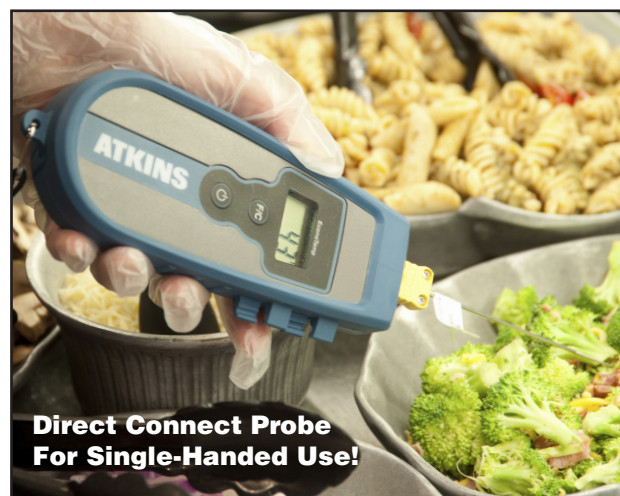
Direct Connect Probe For Single-Handed Use!