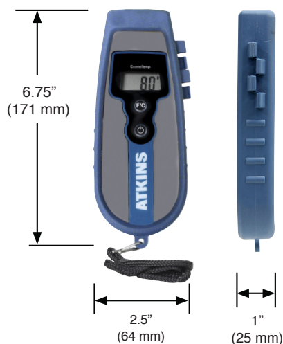
32311-K Thermocouple Instrument