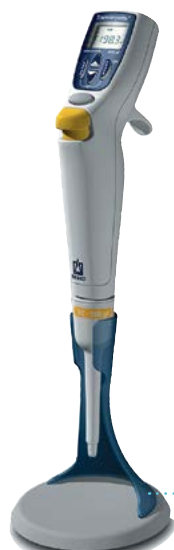
Single channel stand

Transferpette® electronic pipettes from BRAND® – performance, value, and unbelievable comfort