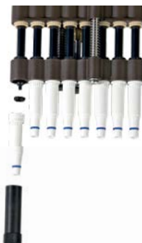
Easy cleaning and maintenance