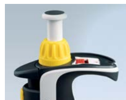
Red recalibration flag indicates adjustment from factory specifications.