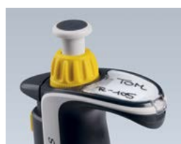
Covered nameplate—identifies pipettes without messy tape!