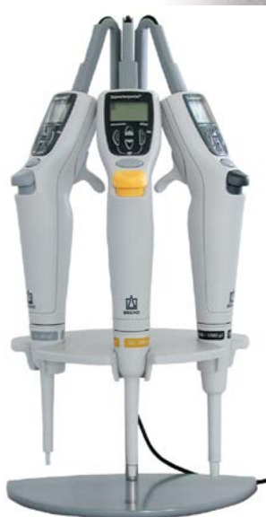
Charging stand for up to three single channel pipettes (excluding 5 mL)