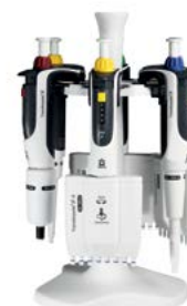
Benchtop rack for 6 Transferpette® S single- or multi-channel pipettes.