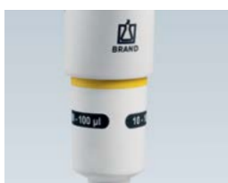
Integrated shaft coupling