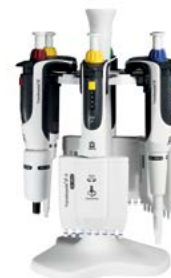
Benchtop rack for 6 Transferpette® S single- or multi-channel pipettes.