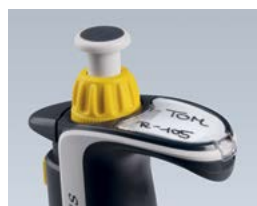
Covered nameplate—identifies pipettes without messy tape!