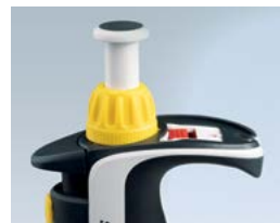
Red recalibration flag indicates adjustment from factory specifications.