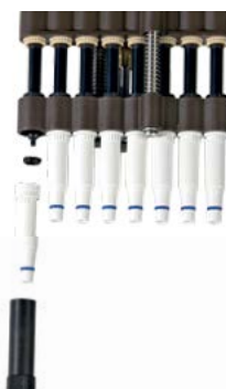
Easy cleaning and maintenance