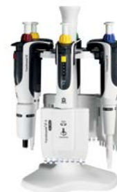
Benchtop rack for 6 Transferpette® S single- or multi-channel pipettes.