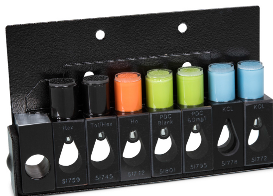
Inside CertiRef Sealed CRM cuvettes