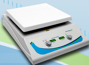
H3710 10 x 10 Inch Series