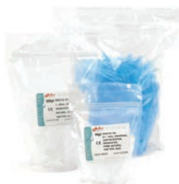
Bulk in bag