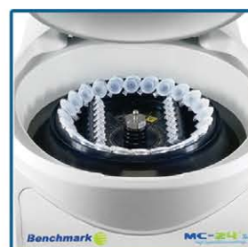
Unique Combi-Rotor™ Accepts tubes and strips