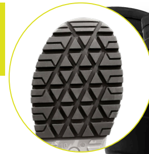
Evacuating non-slip outsole