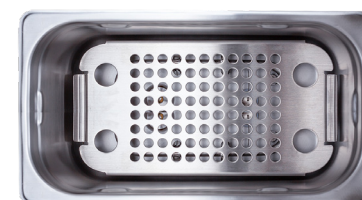
Perforated bottom plate (included)