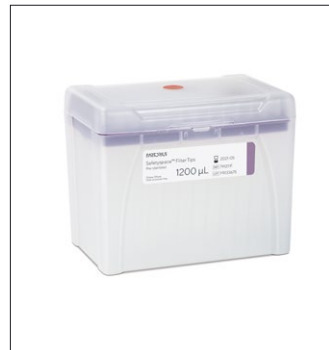
Single Tray racks purity-certified tip racks