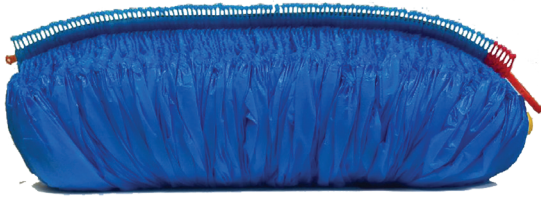
Bundle of Booties

Shoe Cover Refills for KineticButler Automatic Shoe Cover Dispensers