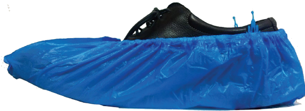
Shoe Cover Dimensions