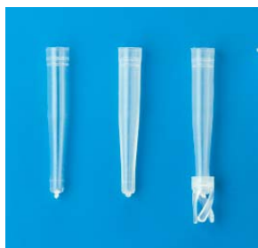
401CP-530, 401P-530, 401PBS-530