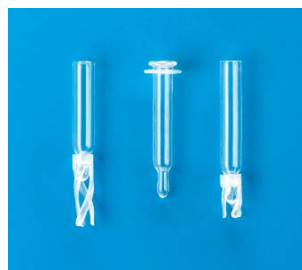
401-530, 401-531, 4015BS-529