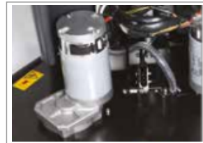
HIGH QUALITY MOTOR GEAR BOX