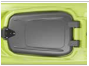
NEW LARGE COVER