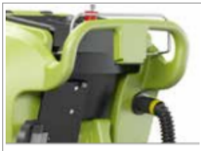
NEW ERGONOMIC HANDLE