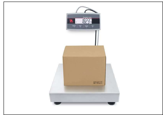
Integrates with shipping system software