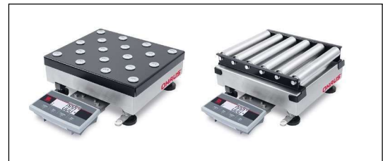
Ball Top and Roller Top Platform Options