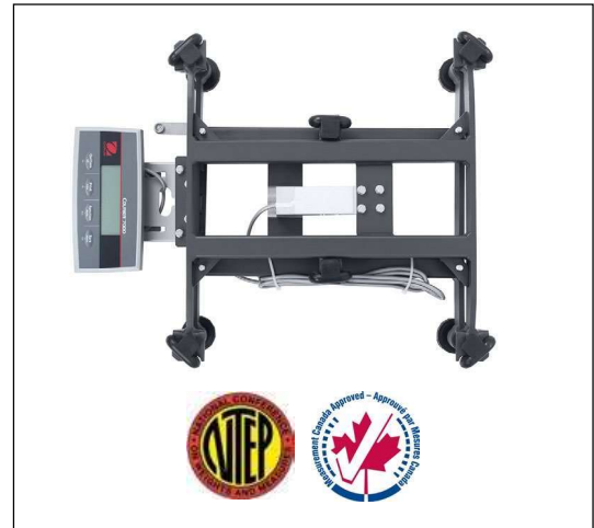
Sturdy powder-coated steel frame holds up to heavy daily shipping use