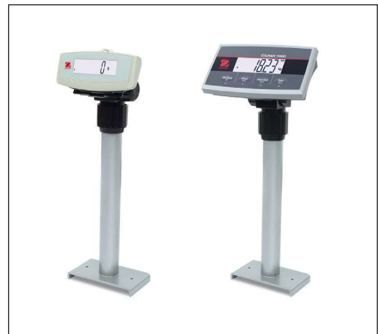
Optional Remote Display on column mount and Column Mount for scale indicator available